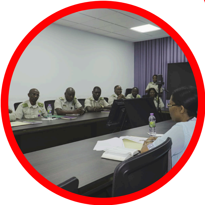
PENITENTIARY SERVICE AND MANANCIAL DO AMOR ASSOCIATION SIGN COOPERATION PROTOCOL.