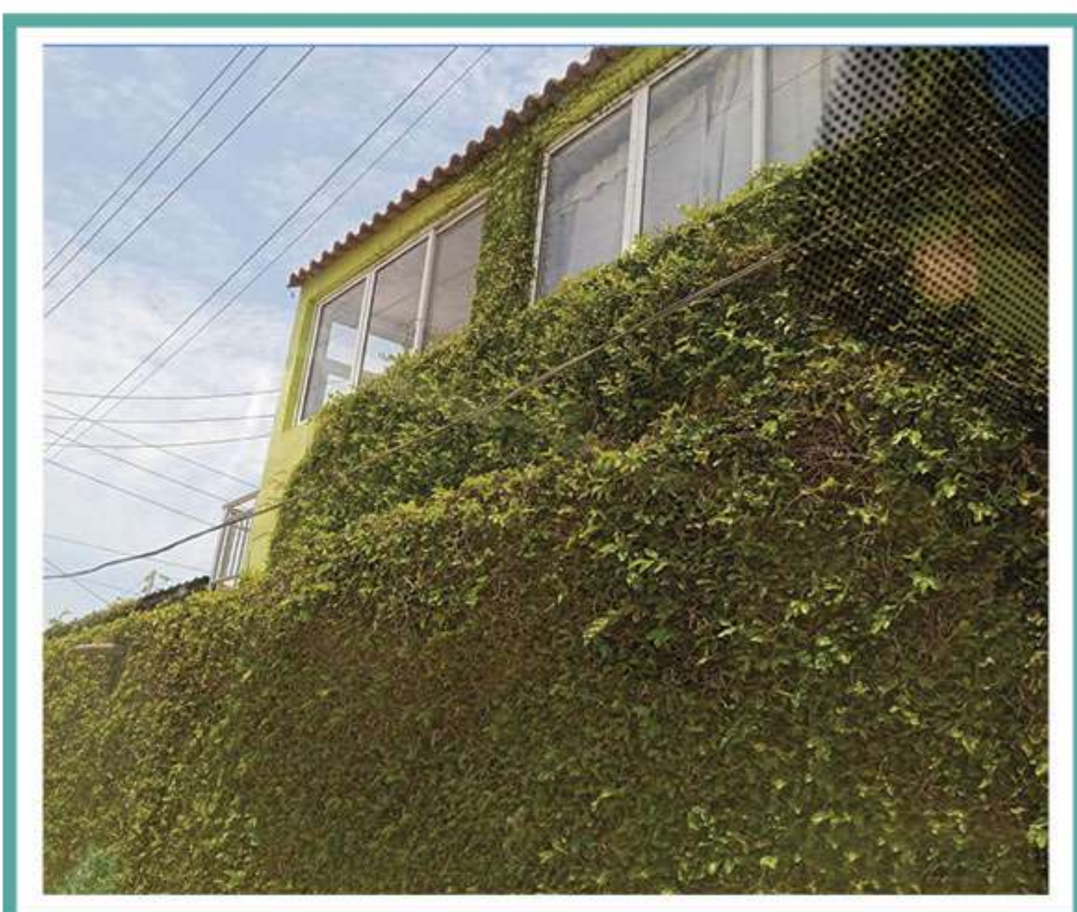
A.M.A Hea Office

In addition to other precautions, a child needs to have a regular and healthy diet if he is to grow up strong. The preaching of the Gospel took on a sustainable form, consolidating the spiritual part with social projects in favour of the most needy. In this way, the Church became an important partner of the government, both in the formation of man and in the protection of human life. It is within this partnership that our Association's work in co-operation with the Church and State institutions is framed.